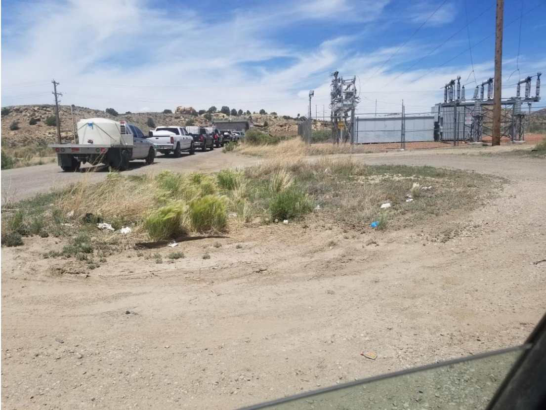
Water hauling station at Gallup, New Mexico