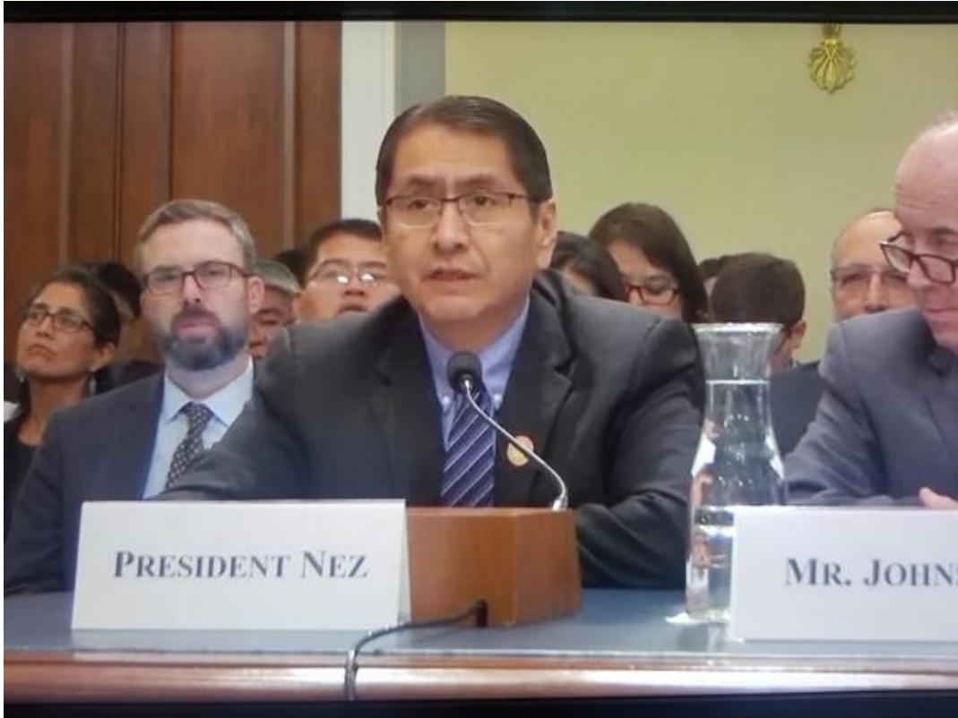
President Nez at congressional hearing for Utah Water Rights Settlement in 2020